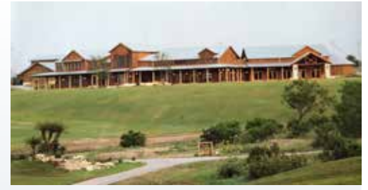
Golf Club of Texas