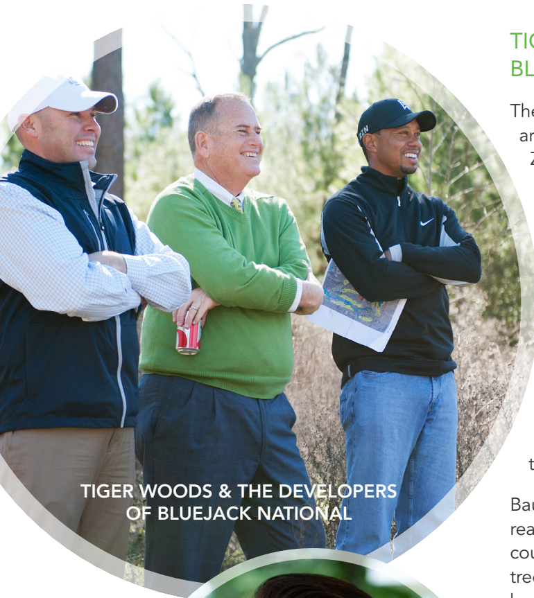
TIGER WOODS & THE DEVELOPERS OF BLUEJACK NATIONAL

Seven holes at Bluejack National opened for play in November with former President George W. Bush as one of the first to swing a club on the turf. A grand opening of all 18-holes and The Playground is scheduled for April.